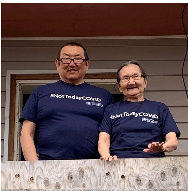
Two Alaska Native Elders wear their #NotTodayCovid shirts.

The Healthy Alaska Natives Foundation (HANF) believes that health care goes beyond the bounds of treating those who are sick. This has never been more important than right now in the midst of COVID-19.